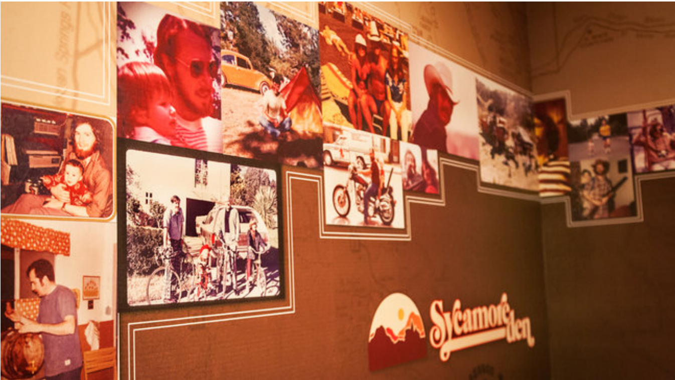
Keeping with the paternal theme, the owners asked people to send in pictures of their own dads, which are now displayed on wall paper in the bathrooms -- kinda cruel if pops shares Biff's aversion to poop.