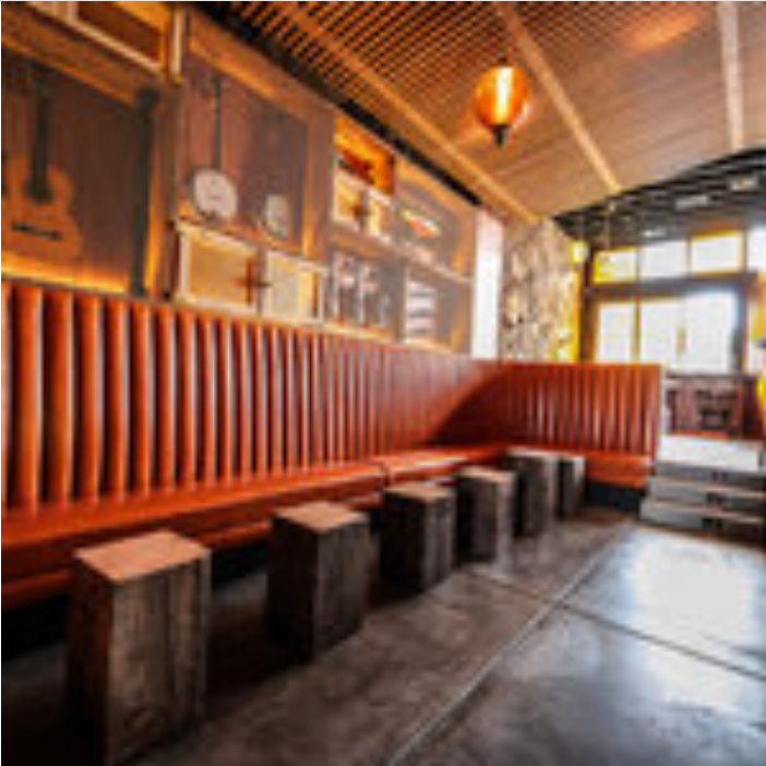
Sycamore Den is a dad-evoking '70s-style drinkery sporting a wall full of rifles, as well as a menu full of inventive cocktails.