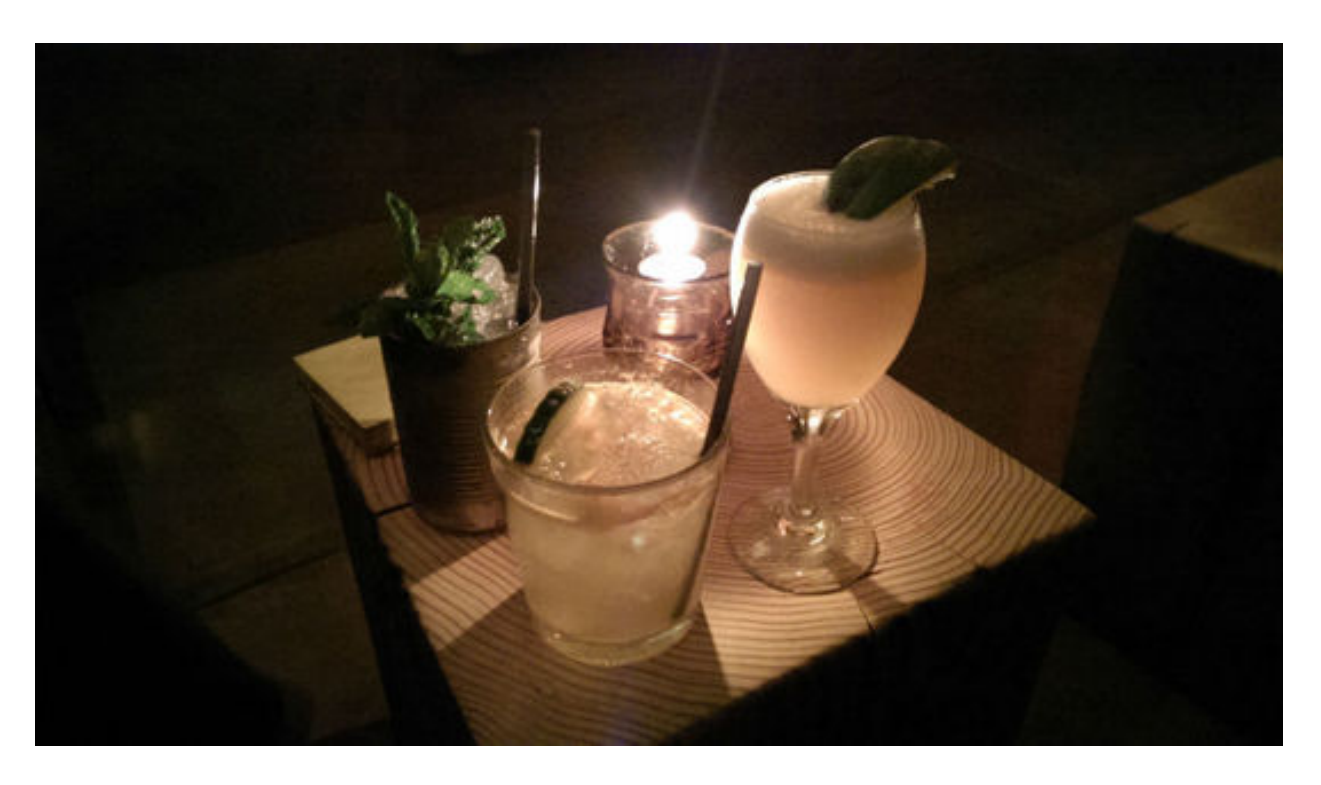
L-R: The Dovetail Julip, blending Gin and Cognac with peach bitters, a fresh sprig of mint, and a kick of Absinthe; Dusty Bottoms, a brisker version of a Bloody Mary that pairs Tequila with cayenne pepper, salt celery bitters, and Cholula hot sauce; Swiss Bank brings an absinthe twist to the rum and pineapple flavors of a piña colada.