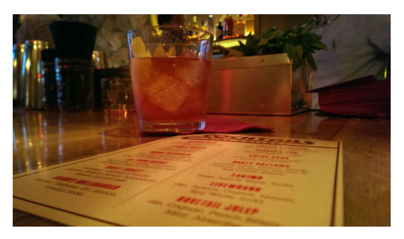
The Monk Improved pairs Rye with Maraschino, Chartreuse, two kinds of bitters and a hefty slice of lemon zest.