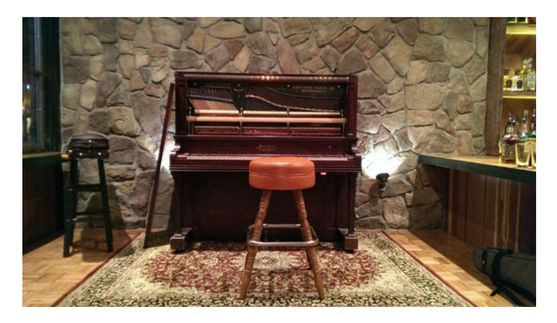
You would expect an antique player piano in a joint like this. What you might not expect is an antique player piano refurbished to run off an iPod and play a jaunty version of R. Kelly's "I Believe I Can Fly," but here it is and it's glorious.